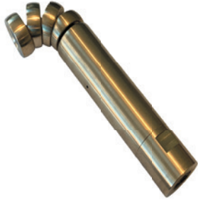
AB18 STOCKED MANDRELS